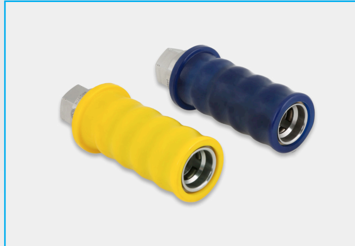
P30 & P36 NGV1 Nozzles

Refuelling and dispensing nozzle for CNG and Bio-Gas applications such as car & bus filling.