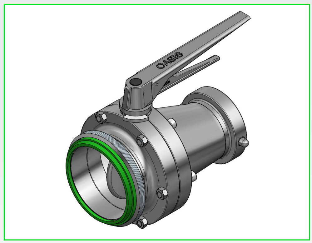
BFV-100 - Vat Outlet Valve