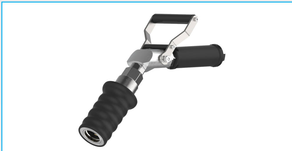
FV103-4-02A-C 45° Fill Valve & NC104-200 Nozzle

CNG and Bio-Gas Dispenser for Bus and Truck filling