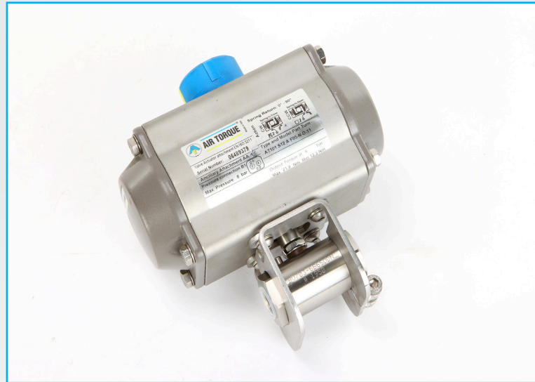
BV704 with Air Torque AT101

Remote ball valve actuation applications such as; Compressor Blow-down, Dispenser sequencing, Isolation, Priority Panels, Storage, Mobile Storage & Transport Trailers. Suitable for CNG, Helium, Bio-Gas, Nitrogen, Air and other gases on enquiry.