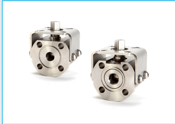
SV104-4O6SDDN-0120 - Sandwich Valve

Dispenser Manifolds, Priority Panels, Emergency Isolation and applications where easy service is required. Suitable for CNG, Helium, Bio-Gas, Nitrogen, Air and other gases on request.