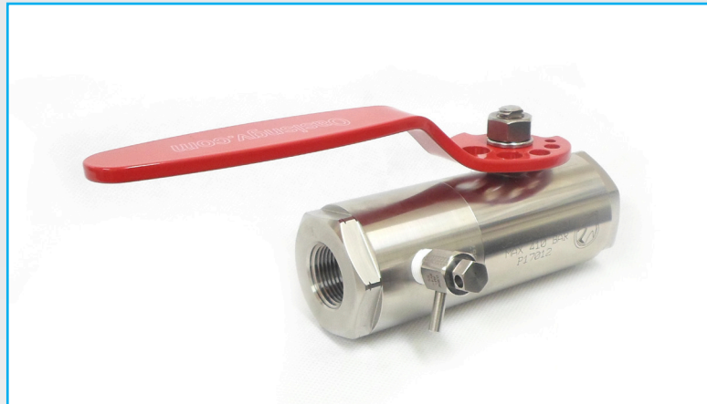
BV706-4E6LDDN-1000 - 3/4" Ball Valve With Vent Valve

CNG Compressors, Dispensers, Priority Panels, Isolation Valves and storage. Allows venting of down stream gas for servicing. Suitable for use with CNG, Helium, Bio-Gas, Nitrogen, Air and other gases on enquiry.