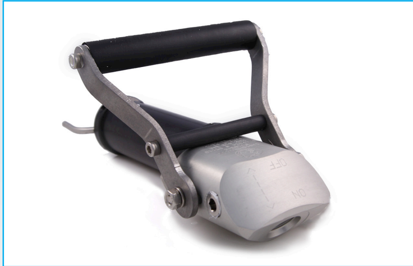
FV103-4-00A-0 45° Fill Valve

CNG and Bio-Gas Dispensers for Car, Bus and Truck filling & CNG Bio-Gas Trailer load/unload systems.