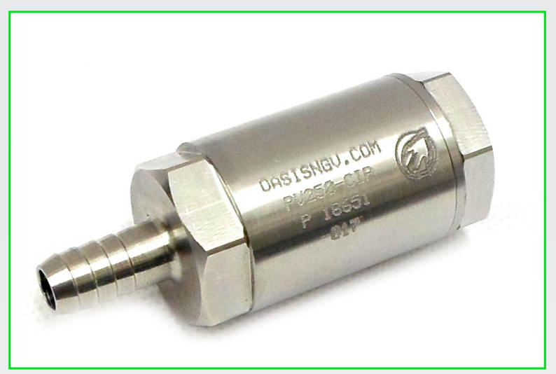
PV250-CIP - CIP Non Return Valve

• Dairy industry, fisheries, chemical industry, water treatment.