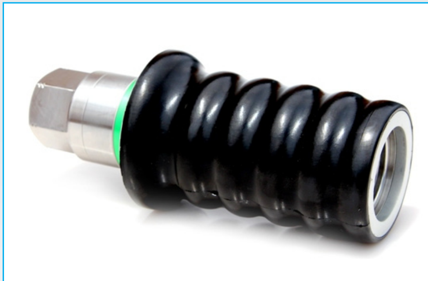
NC104-200 - Bus/Truck Nozzle

Refuelling nozzle for high flow CNG and Bio-Gas applications such bus, truck & trailer filling.