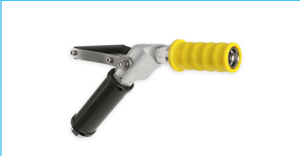
FV103-4-01A-G - 45° Fill Valve & P36 NGV1 Nozzle

CNG and Bio-Gas dispenser for car, bus and truck filling & CNG Bio-Gas trailer load/unload systems.