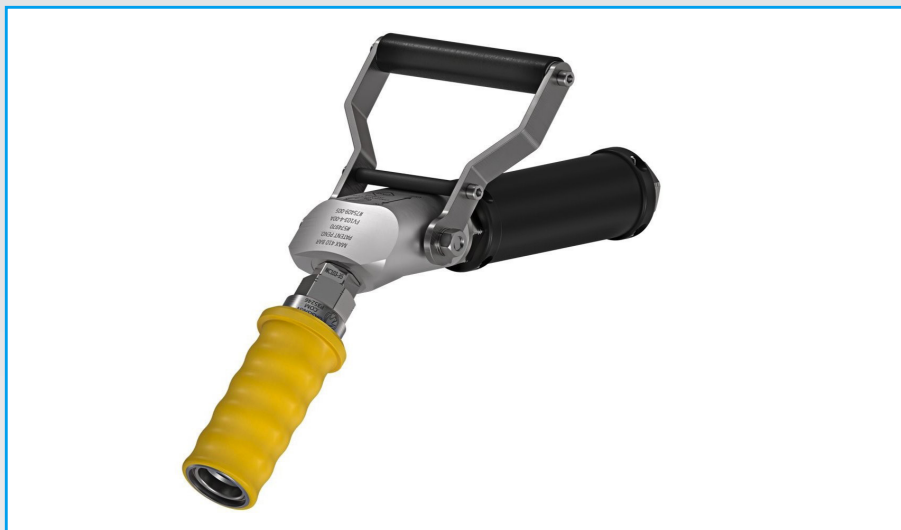
FV103-4-01A-G - 45° Fill Valve & P36 NGV1 Nozzle

CNG and Bio-Gas dispenser for car, bus and truck filling & CNG Bio-Gas trailer load/unload systems.