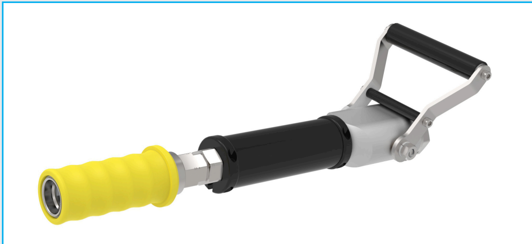
FV103-0-AD6-G - 180° Fill Valve & P36 NGV1 Nozzle

CNG and Bio-Gas dispenser for car, bus and truck filling & CNG and Bio-Gas trailer load/unload systems.