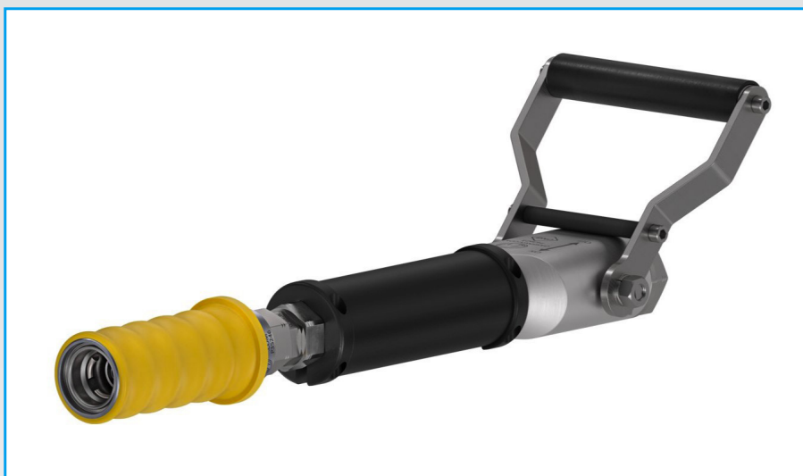
FV103-0-AD6-G - 180° Fill Valve & P36 NGV1 Nozzle

CNG and Bio-Gas dispenser for car, bus and truck filling & CNG and Bio-Gas trailer load/unload systems.