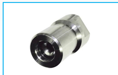
Example of Receptacle DN12

Video servicing instructions available online at oasisngv.com/resources