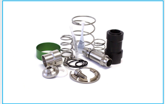
NC104-SK200-1 service kit for NC104-200 nozzle only.

Bus and truck nozzle service kit, recommended to be replaced on or before the maximum cycles before re-kit as identified in product specifications