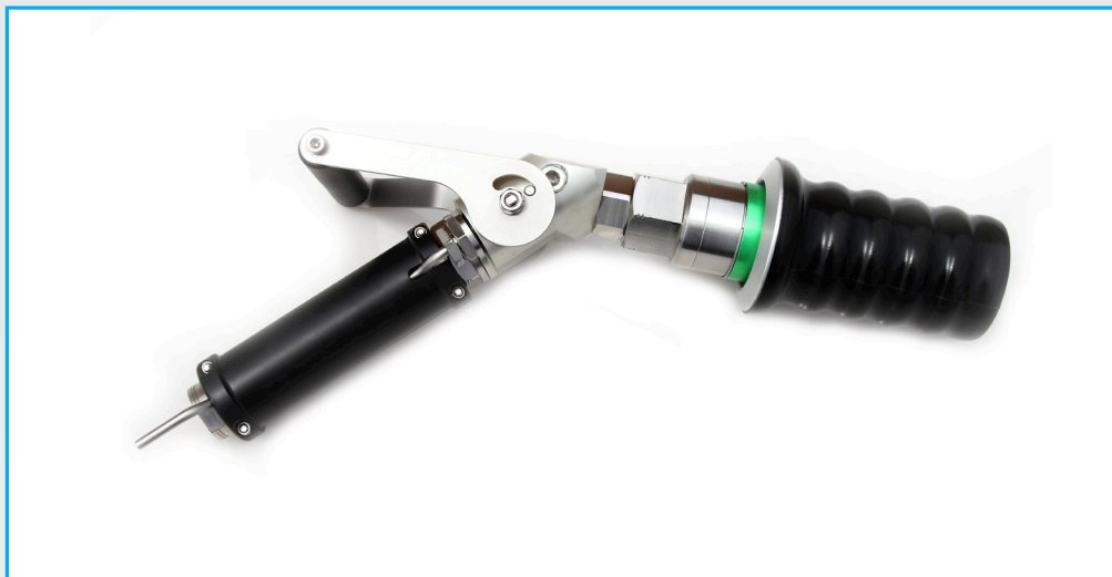
FV103-4-02A-C 45° Fill Valve & NC104-200 Nozzle

CNG and Bio-Gas Dispenser for Bus and Truck filling