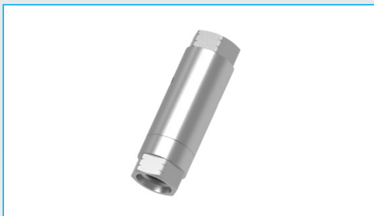
IB102-6AXXP - Vent Hose Breakaway (Only For Vent Hose)

Vent hose breakaway designed for use with both public and private CNG refueling stations.