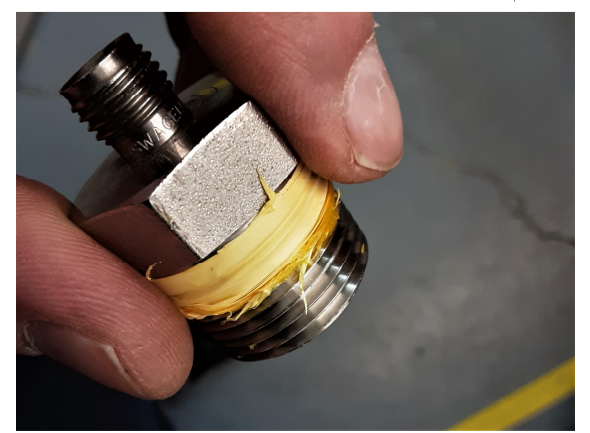
Figure 8. Thread after 5 installations with correctly applied PTFE tape.