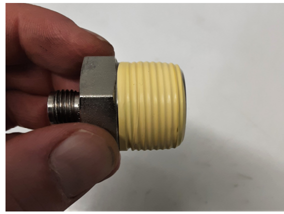
Figure 7. Tape applied to fitting ensuring coverage of all threads.