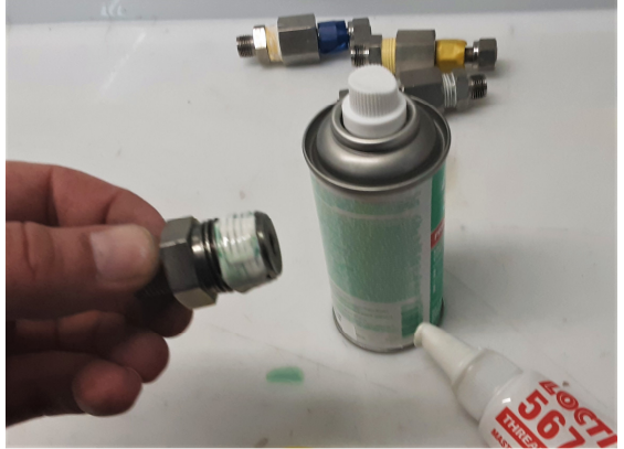
Figure 3. LOCTITE 567 with LOCTITE 7649 primer.