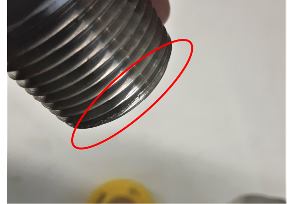
Figure 6. Galling on the first thread (circled) of the fitting after testing with gas-rated PTFE tape. This thread was not covered by the tape.