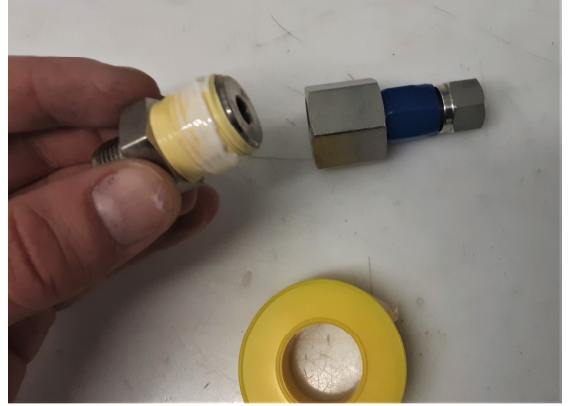
Figure 4. PTFE Thread tape and LOCTITE 567 sealant.