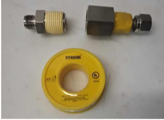
Figure 1. AW TITASEAL PTFE thread tape