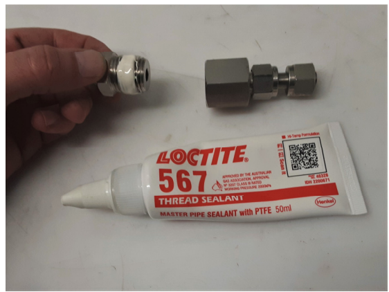
Figure 2. LOCTITE 567 Anaerobic Sealant