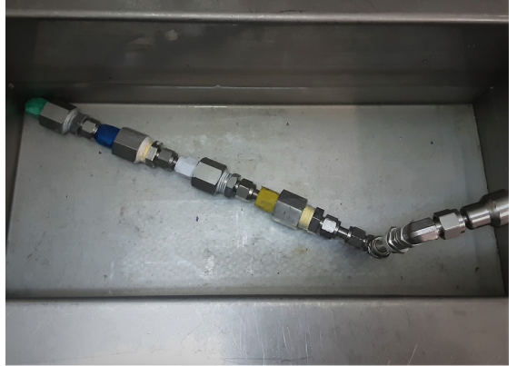
Figure 5. Fittings tested for leakage in water bath.