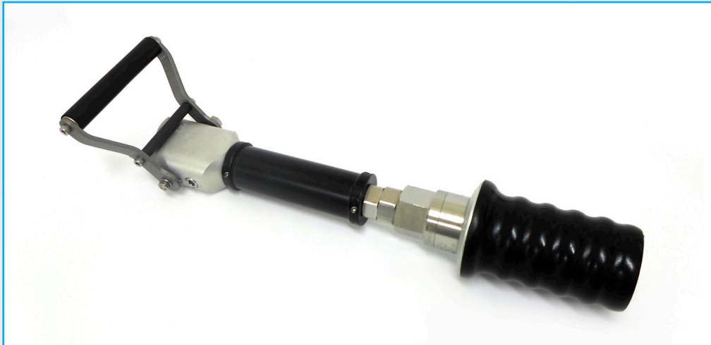
FV103-0-AC6-C 180° Fill Valve & NC104-200 Nozzle

CNG and Bio-Gas dispenser for bus and truck filling