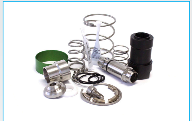
NC104-SK200-1 service kit for NC104-200 nozzle only.

Bus and truck nozzle service kit, recommended to be replaced on or before the maximum cycles before re-kit as identified in product specifications