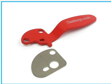
BV702-LH Lock Out Handle and Plate