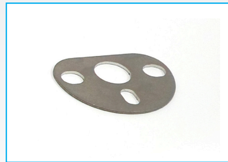
BV703-LH and BV706-LH Lock Out Plates use standard handle (not included)