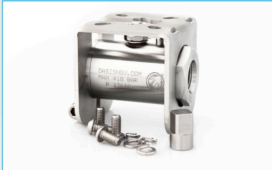
BV704 with Drive Dog & Actuator Mounting Bracket

Dispenser Control Valves, Compressor blow down, Safety Isolation, Trailers, Priority Panels.