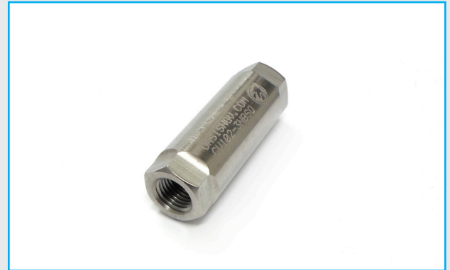
CV102-3NBSO - Check Valve 1/4"