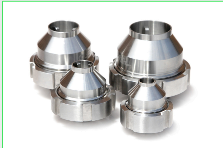
Sanitary Non-Return Valves