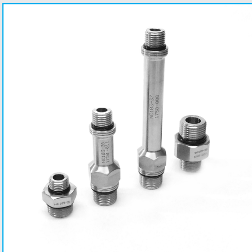
100/50 mm extensions, NC203 and NC104 adaptors.

Adaptors and extensions for fitment of nozzles to fill valves.