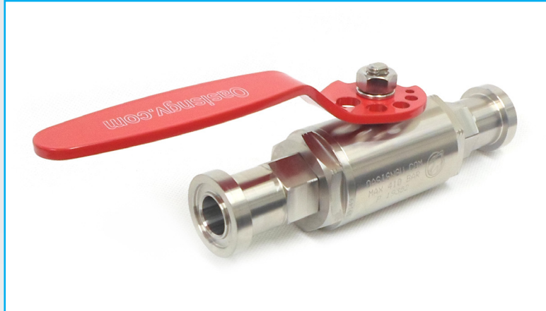
BV706-4Y6LDDN-M000 - Ball Valve with Code 62 Adapters

CNG Compressors, Isolation Valves and Storage. Suitable for CNG, Helium, Bio-Gas and Nitrogen, Air and other gases on enquiry.