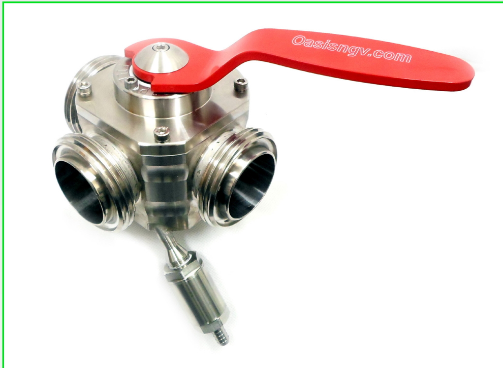
PV250-SV2 - Vat Inlet Valve with CIP