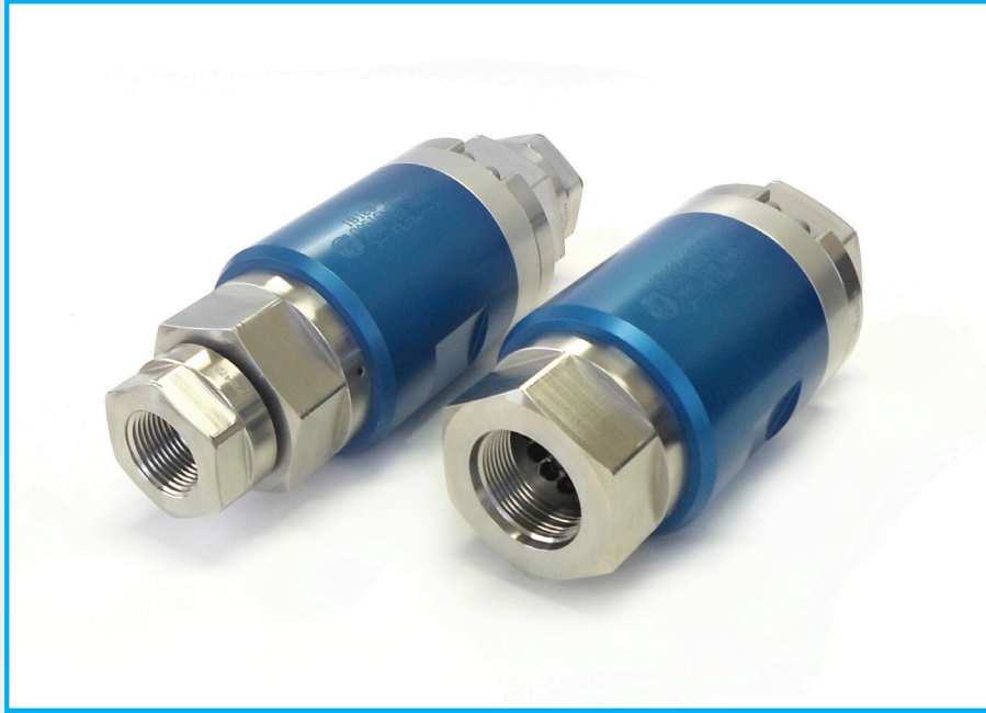
IB108 - Inline Trailer Breakaway

Inline breakaway designed for use with high flow CNG systems such as virtual pipeline transport trailers and bulk storage.