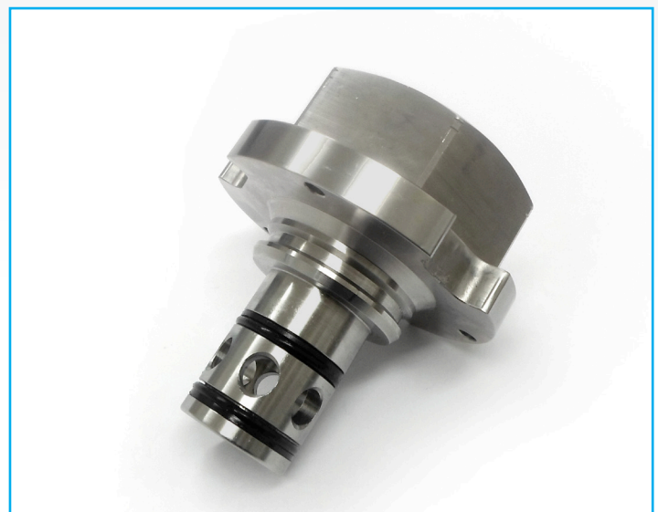
Male end replacement - IB108-ASDSU-M