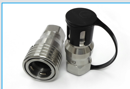
HC308-6NDDN - 1" Quick Release Coupler

Fast Flow Filling Systems, Storage Cascade to Trailer/Transporter, Trailer/Transporter connection to Daughter station and direct feed to CNG Dispensers. Suitable for CNG, Hydrogen and Bio-Gas.