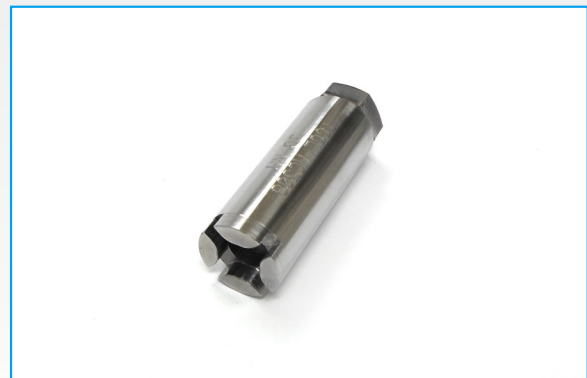
HC308-TOOL - Service tool