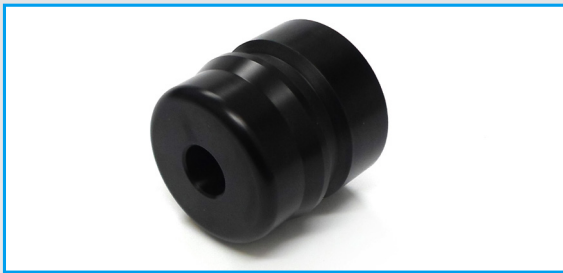
SHC308-18 - Dummy Male