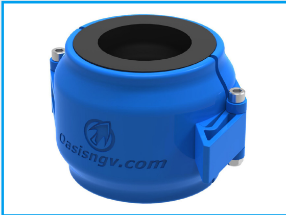
HC308-COVER - 1" Quick Coupler Ice Cover

The Oasis Ice Cover prevents ice build up on the HC308 Coupler while in use in cold climates or high flow applications.