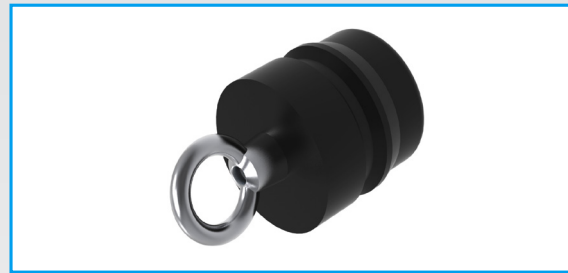
SHC308-28 - Pull Plug Dummy Male