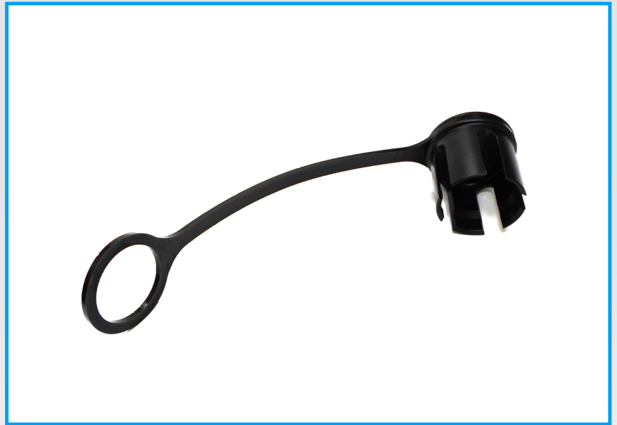
HC308-DC - 1" Quick Release Coupler Dust Cap