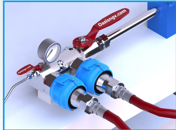
HC308-COVER in use