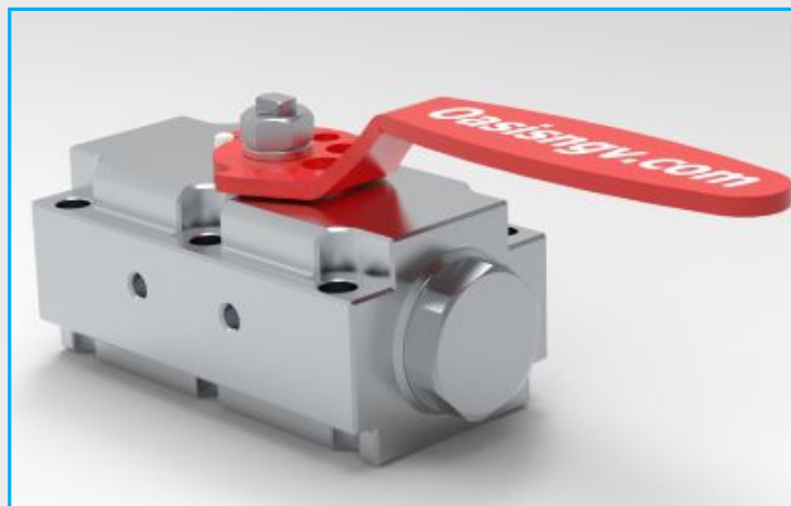
MV200 Series Manifold Valve

Dispenser Manifolds, Priority Panels, Emergency Isolation. Suitable for CNG, Bio-Gas and Nitrogen